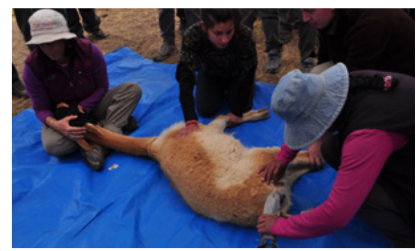
Family group of vicuñas