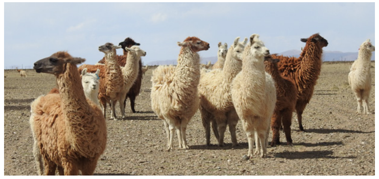
A herd of llamas (Lama glama), a domestic South American camelid, owned by indigenous communities