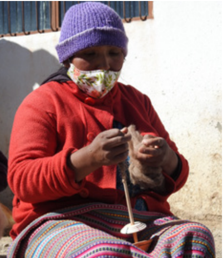
Female herder spinning fibre of vicuña (left) and llama (right)