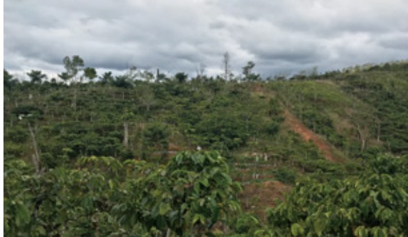
Coffee agroforest in Pagar Alam

Pagar Alam, an upland city renowned for its coffee production, lies on the Musi river upstream basin which is one of the largest watersheds in Sumatra, Indonesia. The watershed provides water to more than 10 million people in the South Sumatra Provinces. The Pagar Alam area is 63,000 ha, which is comprised of protected forest (32%) high on the eastern slope of Mt. Dempo, adjacent coffee agroforest (34%) and other land uses including rubber plantation and rice paddy. The protected forest provides habitat to various indigenous and endemic animals and plants, such as Sumatran tiger, Macaca, and endemic orchids. In the coffee agroforest, smallholders have been growing the robusta coffee ( Coffea canephora ) in a mixed system with fruit trees and annual crops since around 1900. The coffee agroforest, which underwent time-tested adaptation to the climatic and socio-ecological conditions for a century, provides not only coffee and other crops but also vital ecosystem services that underpin people's livelihoods and maintain the upland landscape. Such ecosystem services include carbon sequestration, soil productivity, resilience against pests, disease and natural disasters, water purification as well as wildlife habitats.