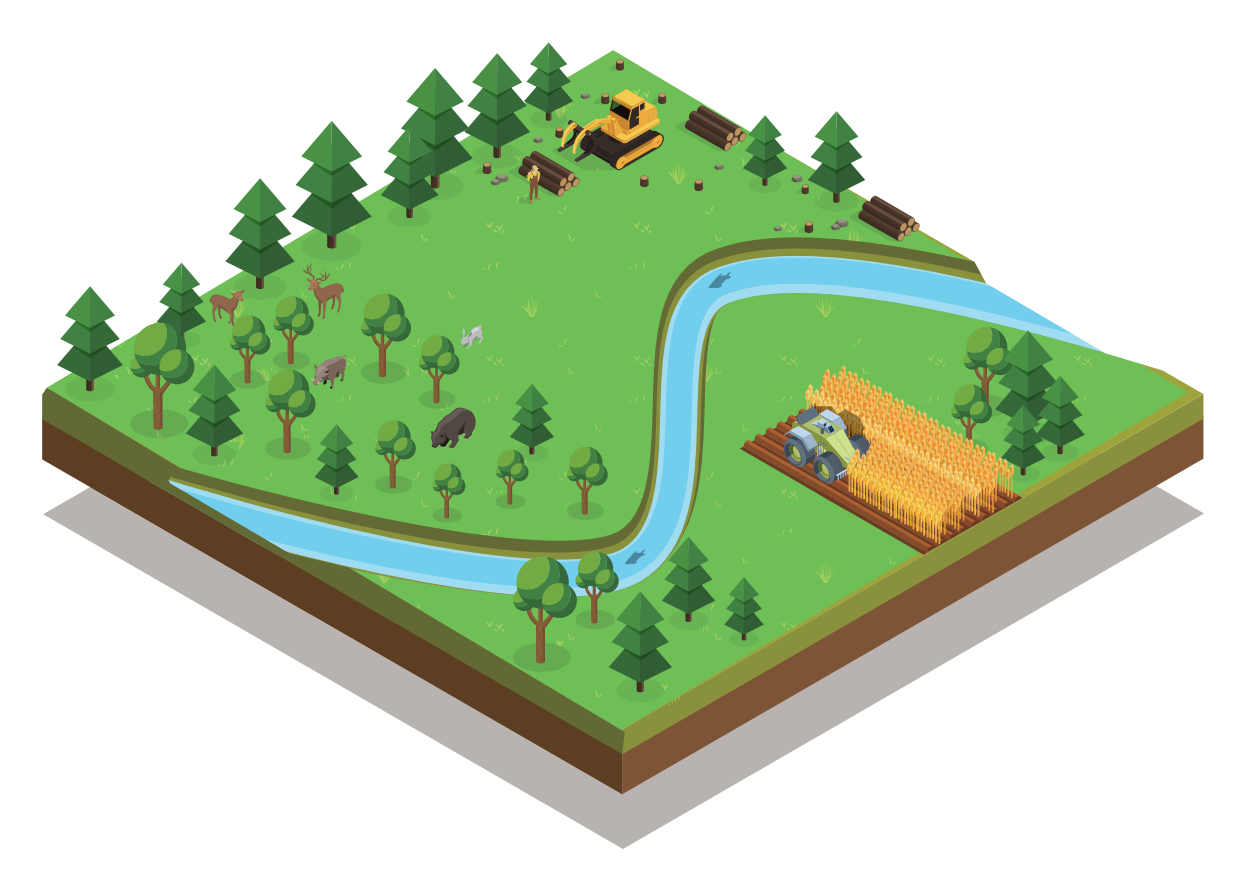
Figure 1. A stylized representation of a terrestrial landscape, with different land-use types such as natural ecosystems, agriculture, forestry, settlements, and a waterway. Different land-use types typically have different people using them. However, within a land-use type there may also be different users, using the land for different purposes. The various elements of a seascape are less spatially explicit, but have similar characteristics in terms of users and use.

Without landscape approaches, conservation is less likely to happen, especially outside formally protected areas. A relatively small proportion of the planet is formally protected. Even areas that are protected are typically disconnected and are not always well managed. Target 3 of the GBF is to protect at least 30 per cent of terrestrial and inland water areas, and of marine and coastal areas; while goal A stresses the importance of the integrity, connectivity, and resilience of all ecosystems. Achieving such ambitious global conservation aims requires inclusive conservation outside protected areas, with the buy-in of a diverse range of stakeholders.