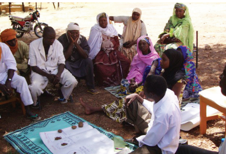
During baseline assessment in Niger, stones are used as markers.

The long-term persistence of community-managed SEPLS that employ appropriate management and use of natural resources and biodiversity defines them as resilient systems. Nevertheless, many communities face growing challenges in maintaining these landscapes and the social and ecological processes that sustain them, especially in the face of rapid and often interrelated changes in socio-economic systems, accelerated by increasing climate change and ecosystem