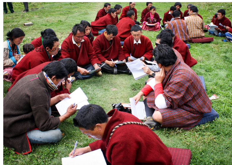
Strengthening the resilience of Bhutan's Gamri Watershed through community-led projects.

The Indicators of Resilience in Socio-ecological Production Landscapes and Seascapes (SEPLS) were developed in 2012 by Bioversity International, now the Alliance for Bioversity International and CIAT, and the United Nations University Institute for the Advanced Study of Sustainability (UNU-IAS) to help communities self-assess, plan strategically and monitor their socio-ecological resilience.