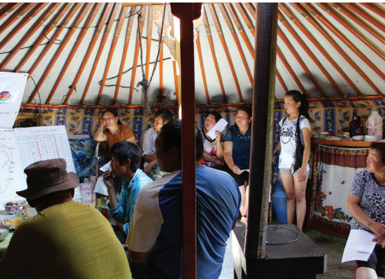
Discussing the results of the indicators scoring exercise in plenary, Khotont district, Mongolia.

geographic boundaries (e.g., a watershed) or by other factors.