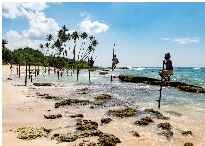
Stilt fishers in Sri Lanka.

Landscape and seascape boundaries can be defined in different ways. Ecological boundaries might be where land meets water or the transition from plains to mountains. Administrative boundaries could be municipal borders or community limits.