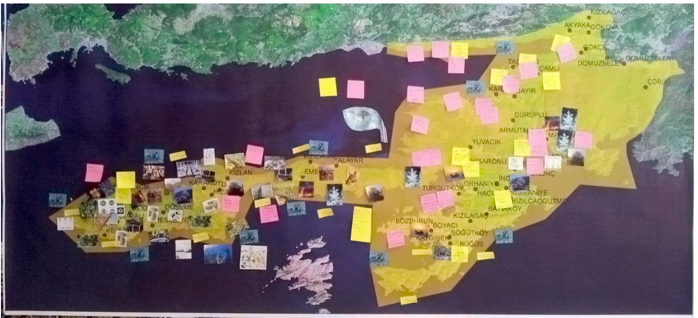
Composed map of Datca Bozburun after the mapping exercise

This indicator intends to capture the extent to which the mosaic nature of the land/seascape is maintained. This is linked to the understanding that the higher the mosaic nature of a landscape, the more its capacity to be resilient to natural shocks.