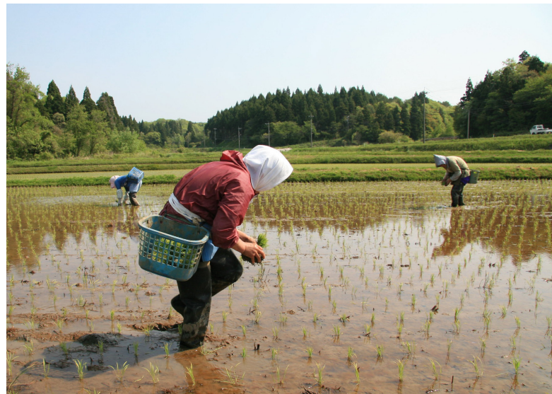
Rice Farmers in Ishikawa, Japan.

These landscapes and seascapes vary widely due to their unique local climatic, geographic, cultural and socio-economic conditions. Yet, they are commonly characterized as dynamic bio-cultural mosaics of habitats and land and sea uses where the interaction between people and the landscape maintains or enhances biodiversity while providing humans with the goods and services needed for their well-being.