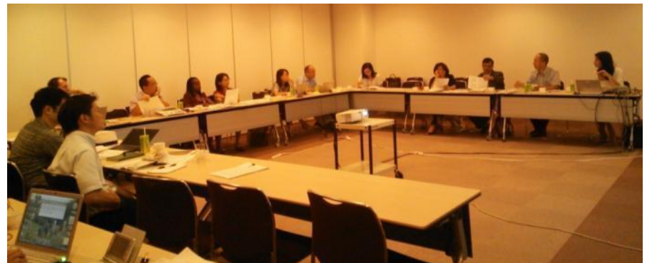
Expert workshop (July 2013)