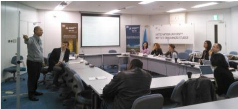
Scoping workshop (April 2013)