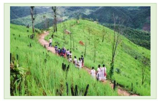
Morning walking for do weeding in the rotational field

Objectives Strengthen and promote culturally-based agriculture and natural resource management of Karen people in target area and for them to become a good model recognized by government agencies and replicable by other communities. Empower community leaders, organizations and networks to become effective in expressing their cultural and traditional knowledge and practices, Mainstream customary sustainable practices into local and national sustainable development and biodiversity policy (e.g. NBSAP) and practice through recognition by government agencies and in relevant policies and laws.