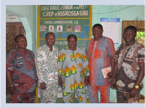
ELABORATION OF BCP DOCUMENTATION OF TK