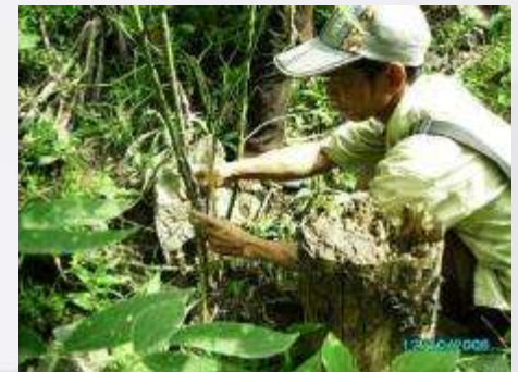
Forest conservation - Laos