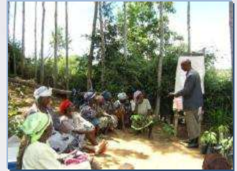
Farmers Workshop- Kenya

Harmonization between Nature Conservation and Human Activities