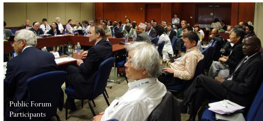
Public Forum Participants