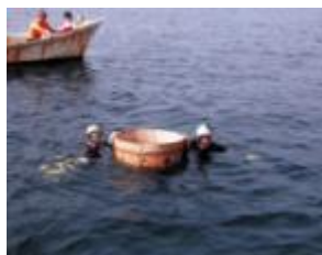
2011 - Noto's GIAHS (Globally Important Agricultural Heritage System)