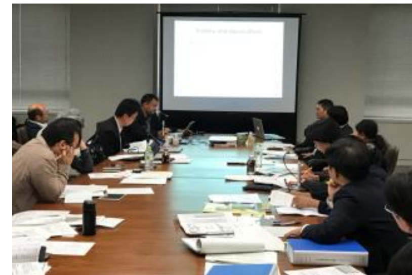
GIAHS Training session 2016 with government officials from Laos, Myanmar