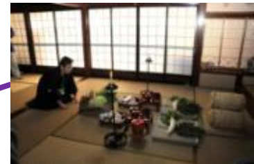
2009- Aenokoto: agricultural ritual

International designation sites in Ishikawa Prefecture, Japan