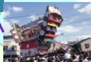
2016- Seihakusai float festival