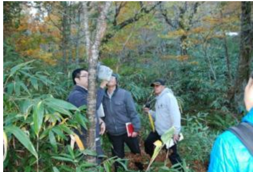
Workshop with Asian BR practitioners 2016