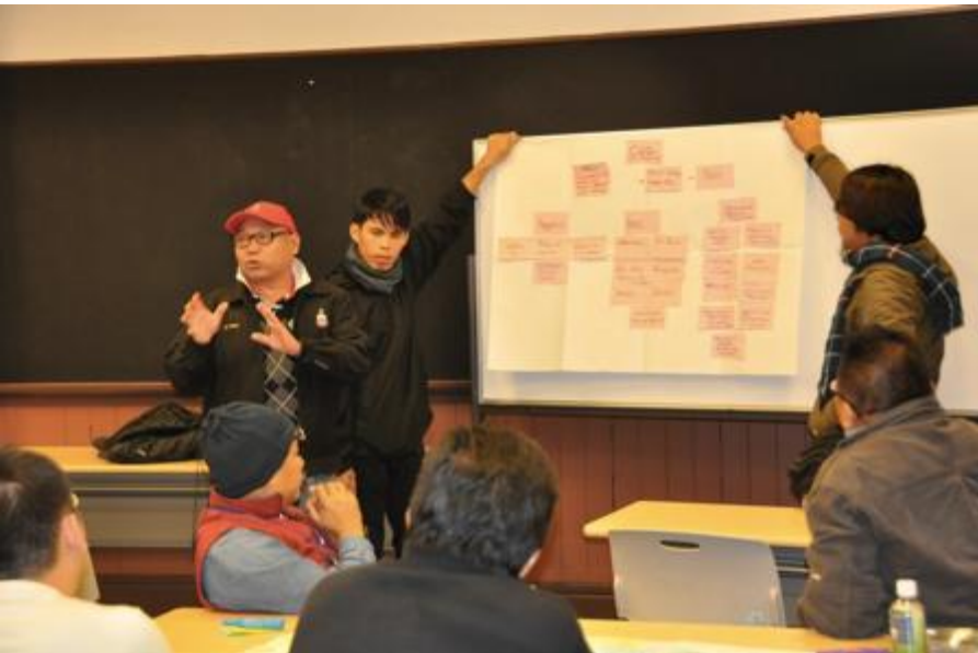
JICA training on environmental communication November 2015